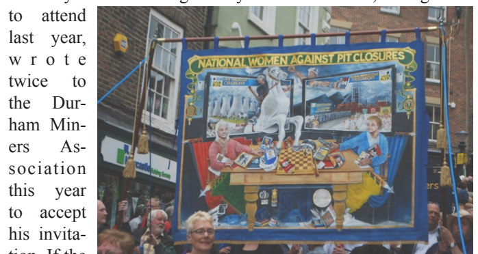
National Women Against Pit Closures

In deep contrast, the national media, who had refused to report on the Durham Miners Gala over decades, made the issue the return of the leader of the Labour Party, Ed Miliband, to speak at the Big Meeting after a gap in which the Labour Party leaders have boycotted attending for 23 years. Ed Miliband, having failed