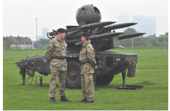
Missiles on Blackheath

the occasion for the overt use of the military in public life.