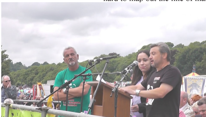
Spanish Miners Addressing the Big Meeting

opposition, become organised as an effective independent political force in their own right, and become a powerful force to change society!