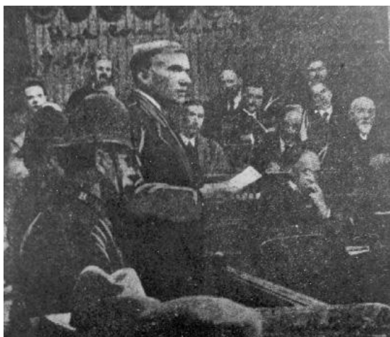
Speech of John Maclean from the dock at his trial for sedition, May 9, 1918

workers in Glasgow took unofficial strike action against the attacks on their living standards. Local shop stewards organised what became the Clyde Worker's Committee, with hundreds of delegates elected directly from the workplace meeting on a weekly basis. Thousands of workers in South Wales also took strike action against repressive government legislation aimed at curtailing their rights, while in 1917 engineering workers throughout Britain went on strike in opposition to government plans for more widespread military service and other anti-worker measures.