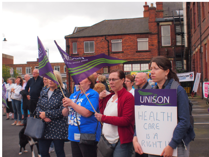
The first leg from Jarrow to Chester-le-Street

The march was supported by All Together for the NHS, a