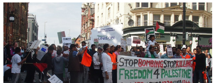
Demonstration in South Shields, North-East England, in support of the Palestinian resistance, August 5, 2014

Police estimate that 45,000 marched on July 26 from the Israeli embassy in Kensington to Parliament Square, but the actual number looked much higher.