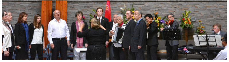
Commemorative Concert in Ottawa on August 16