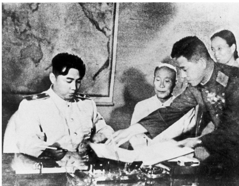
Kim Il Sung signing the Armistice Agreement at Panmunjom on July 27, 1953

Korea and countering the US imperialists' threats and hostility is a crucial and outstanding factor for peace in East Asia and globally. The goal of the reunification of Korea "by our nation itself" would enable the 75 million Korean people to take their rightful place as a fully independent nation that stands for peace and friendly relations between nations and peoples.