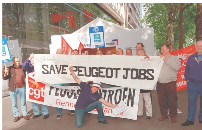
Peugeot workers demonstrating in Paris

THE WORKERS MUST RELY ON THEIR OWN STRENGTH AND ORGANISATION – THEY HAVE THE SOLUTIONS, THEY MUST DECIDE!