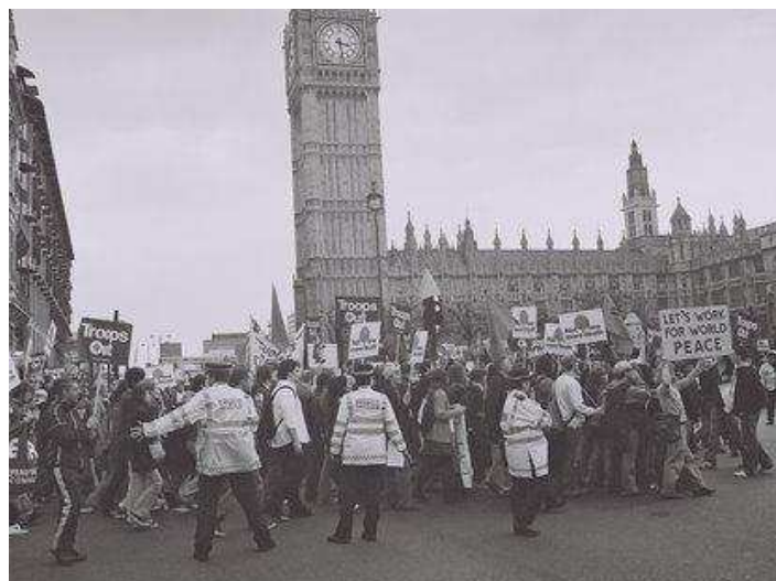
Demonstrators on Monday 8 October outside Parliament

A s Gordon Brown made his statement on Iraq in what is upheld by the monopolies, government and media, as the centre of representative democracy, the Houses of Parliament, the people marched on this centre with the spirit of a democracy in