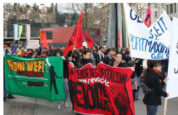
Demonstration against World Economic Forum, St Gallens, Switzerland

believes that security and prosperity within the EU demands more purposeful action beyond Europe's borders." The new Treaty will facilitate such action by the EU. It will do so not least by strengthening the military capacity of the EU to act independently of NATO and by establishing a new minister for foreign affairs, the High Representative of the Union for Foreign Affairs and Security Policy, backed up by a new foreign ministry, the so-called External Action Service, which will work in conjunction with the diplomats of member states. Amongst other things it is to be noted that the Lisbon Treaty commits member states to "undertake progressively to improve their military capabilities".