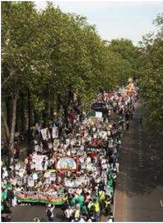
15,000 people demonstrated in London on May 10, 2008