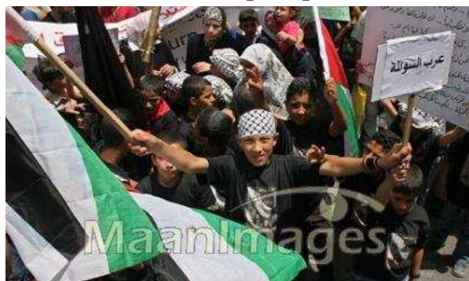
Photos clockwise from above: Nablus, May 15, 2008; Key symbolising determination of refugees to return to their homes; demonstrator at Toronto rally on May 10 affirming Free Palestine; Painting on the wall of the Aida refugee camp in Palestine; Possibly world's largest key, symbolising right of return.