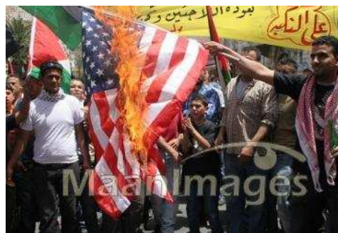
Nablus, May 15, 2008

which was adhered to by successive British governments after 1917, "can be considered the root of the problem of Palestine...It ultimately led to partition and to the