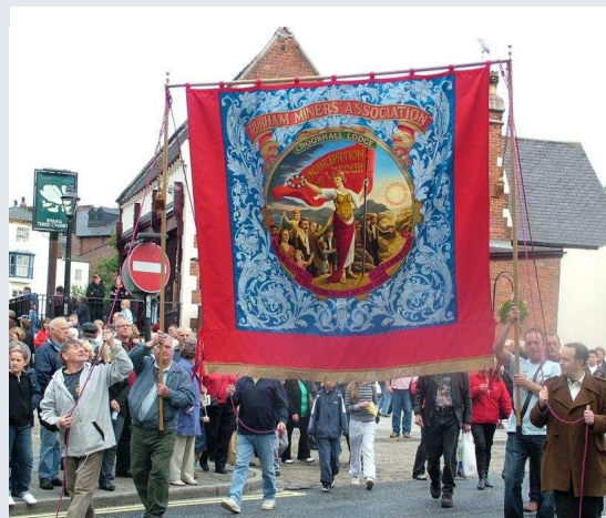
Durham Miners Association banner bearing the slogan "Emancipation of Labour"

The message of the day was that workers must take forward this successful defence of their interests and traditions to work to build a workers' opposition that has its own motion and self-consciousness to strengthen their political and economic organisation. To bring forward new worker politicians that can intervene in the political process and fight for the programme of the working class and strengthen the work to take up responsibility for the fate of society. Such a programme fights to accomplish crucial tasks at this juncture of history: to guarantee the rights of all, for an economy that stops paying the rich and increases investments in social programmes, and the establishment of an anti-war government.