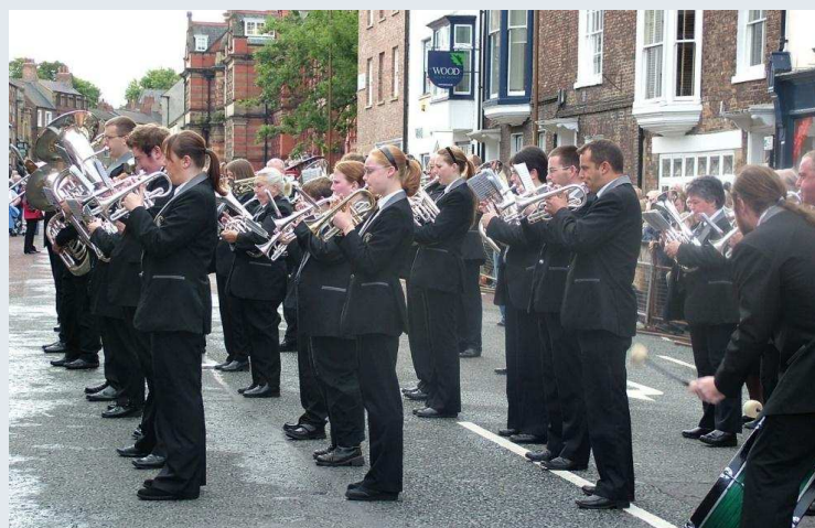
Band in Durham on July 12

British Coal was to blame for the miners' injuries and diseases over decades. He said that as a result of the DMA's decision and looking at