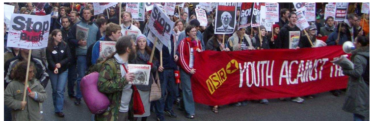
Above: Youth at the forefront in demonstrating against Bush's visit to Brown on June 15 this year Below: Youth demonstrate at European Social Forum on October 17 2004.

The government and monopoly media are renewing their attack on the youth with the hysteria promoted around "knife crime". The Prime Minister has announced that the government is publishing a "youth crime plan", to