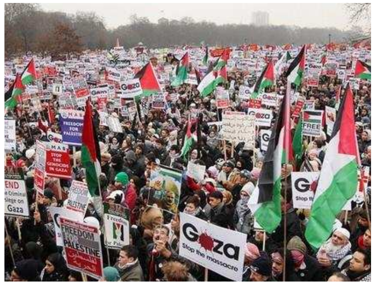
Actions in solidarity with the Palestinian people have continued across the world. Photo shows Hyde Park, London, Saturday, January 10, 2009.

O ne of the most significant features of the recent onslaught against the people of Gaza, in which over 1300 Palestinian people, many of them children, have been slain has been the stand of the British government,