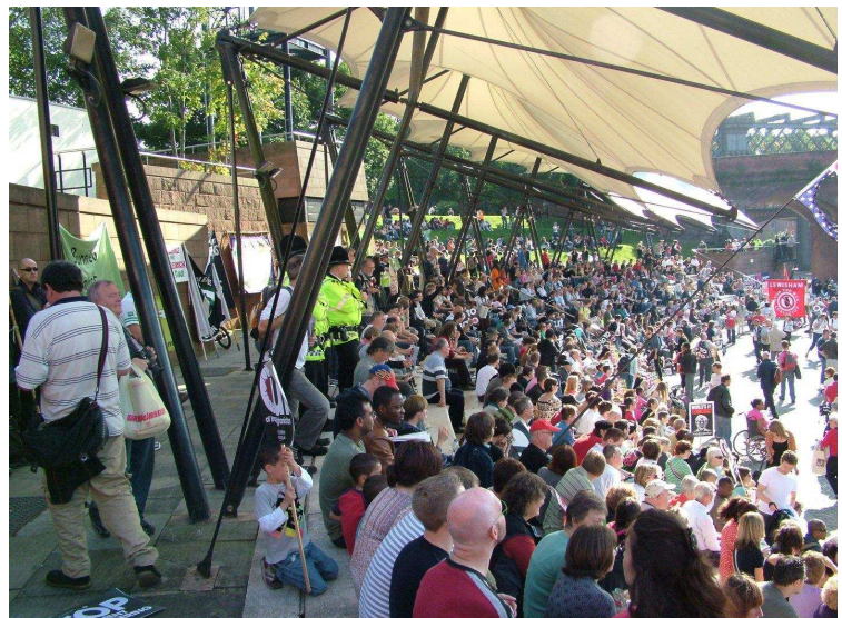
Demonstration against pro-war, anti-social Labour government, Manchester, September 20, 2008

G ordon Brown last month announced a new set of measures to bail-out the banks, which he said would tackle the withdrawal of credit by the banks from businesses and families. The bottom line was to boost the balance sheet of the banks, and