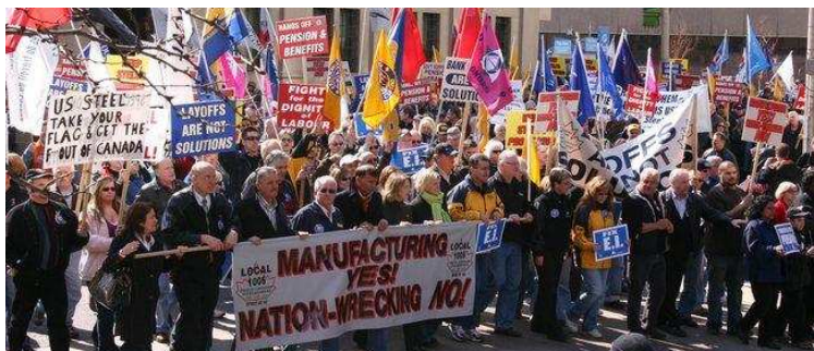
Steel workers demonstrate in Canada

Working and Oppressed Peoples of All Countries, Unite!