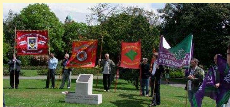
Workers Memorial Day event at Municipal Park in Portsmouth, showing memorial

The pain and outrage of workers and their families killed and injured in the course of work is being channelled into a struggle to enforce the right to healthy and safe working conditions, and to demand that the government and the monopolies fulfil their responsibilities in this respect.