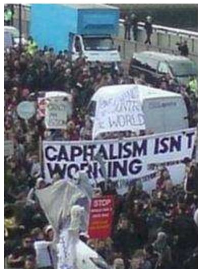
Put People First, March 28, 2009

The events at Geneva have highlighted the fact that Britain, the US and their allies have adopted the most reactionary and hypocritical positions just as they did at the UN Conference in 2001. They are the defenders of all that is most backward in the world and the most zealous supporters of Zionist Israel. It is they who stand exposed and condemned by world opinion and by all democratic people.