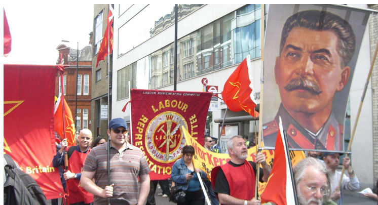
Photos from top: May Day March in London. Two photos from Revolution Square in Havana on May Day. Banner calls for increased productivity and efficiency in the Cuban economy; Head of the London march. May Day Demonstration in Newcastle, May 2.