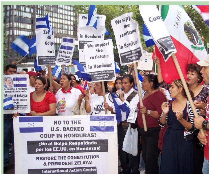
Demonstration in New York as Latin American leaders speaking at UN demanded Zelaya's return to office

These constant meetings of the imperialist groupings, which the US dominates, are meant to ensure no competitor emerges to challenge its superpower status and to present an image of being all-powerful with no alternative even possible to imagine. But that is illusory and against the progressive flow of humanity. The working class and peoples around the world are rising to establish their nation-building projects and vest sovereignty in the people in opposition to the imperialist system of states. The peoples everywhere simply refuse to stop resisting and fighting for their rights, which are theirs by virtue of being human. The working class in the developed capitalist countries have all re-established their communist parties and are strengthening their resistance to the anti-social offensive and preparing the subjective conditions for a pro-social alternative. Workers should not be divert-