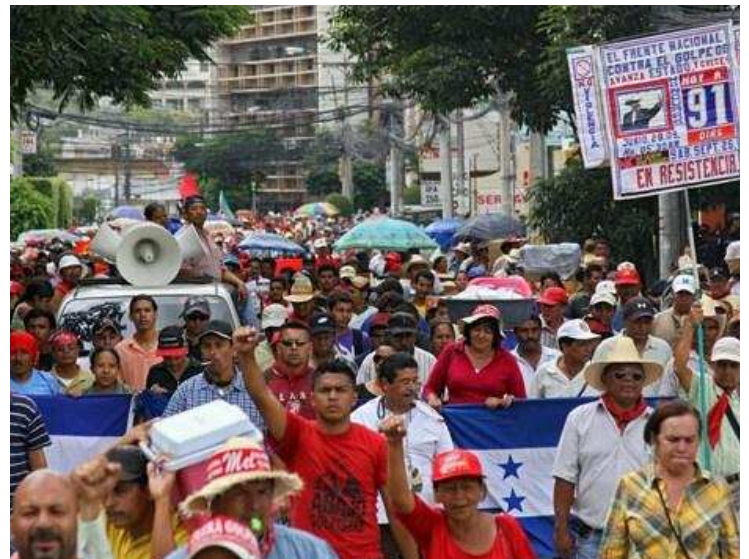
March on Brazilian embassy in Tegucigalpa, September 27, 2009, day 91 of the coup

W orkers' Weekly salutes the heroic resistance of the Honduran people which has now won another victory with the return of their constitutional president Manuel Zelaya, 86 days after being forced out of the