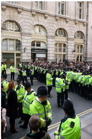
Protests against the G20 talks held at the Bank of England on April 1, 2009

The demonstrations and denunciations against the G-20 Summit expressed that the imperialist system of states has had its day. This system has proved with its many failures, constant wars and inability to solve the world's social and economic problems that it is unfit to govern anywhere and must be replaced by workers and their allies governing themselves and by the peoples of the world finding their own way forward without interference. It is out of the rejection and overthrow of the imperialist system of states and its agenda of war, exploitation and interference in the affairs of others that a new and just world will emerge. The working class and its