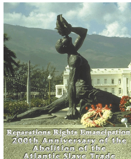
"Le Negre Marron" (The Black Maroon), Port-au-Prince, Haiti. The statue commemorates the Haitian revolution of 1791 to 1804 which affirmed that all have rights by virtue of being human.

Under the signboard of "multiculturalism", the historic role of the national minority peoples has continued to be denied. Indeed, Black History Month itself can be said to have a negative side in that the history of national minority peoples is ghettoised as something apart from mainstream history. The other negative aspect that the powers-that-be promote about "multiculturalism" is the confusion of identity, nationality and citizenship. Of course, it is undeniable that in one sense Britain is a multicultural society, and it is very important that this is recognised, and that the pressures for assimilation on the one hand, or that national minority communities are second class human beings, on the other, are combated. The negative form of multiculturalism is also brought into play when it is promoted that separation is going too far, and that national minority communities are not espousing "British values", and that "national security" is under threat from what this sense of separation is giving rise to. In this sense, the term "mul-