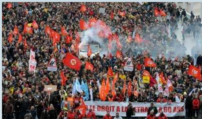
French protests in Lyon against pension reforms