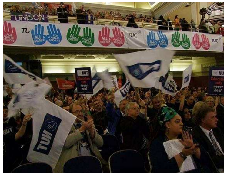
All Together for Public Services rally in Central Hall, Westminster, on the eve of the CSR

T he Comprehensive Spending Review (CSR) is nothing but a vicious escalation of the anti-social offensive on behalf of the rich. It is an intensification of the class struggle by the global monopolies and the financial oligarchy against the working class