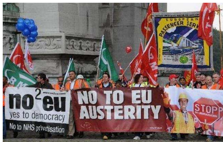
Demonstrating in Brussels on September 29

The working class points out that this is a dysfunctional society, that the governments of the rich are not addressing their responsibility of how to remedy this dysfunctionism, that the consensus in Westminster about where cuts should come and how quickly should be smashed. This can be done by building a Workers' Opposition which upholds that if the crisis is addressed by first examining that the pay-the-rich